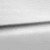
Stainless Steel Inox - SST

Digital: Not all screens are calibrated the same, and therefore, colors will appear differently between screens. Physical: When texture is involved, there will be variations in color, character and tone within a product series and between product families.